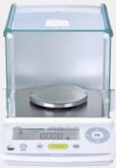
TW223L TW323L TW423L TX223L TX323L TX423L