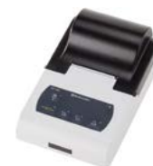
Electronic Printer EP-100