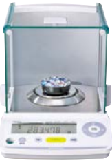
TWC323L TXC323L TWC623L TXC623L