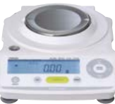
TXB222L TXB622L TXB422L TXB621L