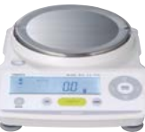
TXB2201L TXB6201L TXB4201L TXB6200L