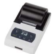
Electronic Printer EP-110