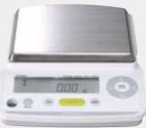
TX2202L TX3202L TX4202L