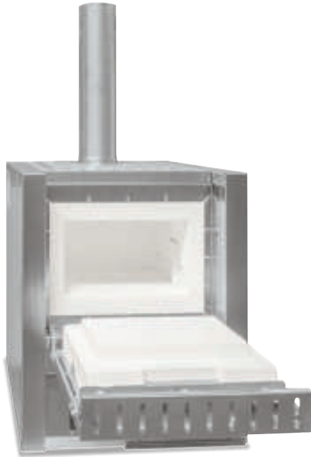
Ashing furnace LV 5/11

Ashing furnace LV(T) .. 11 is designed especially for ashing processes to 1050 °C in the laboratory. Applications include determining loss on ignition, ashing food and plastics for subsequent substance analysis. A special fresh-air and exhaust air system ensures that the air is replaced 6 times per minute so that there is always sufficient oxygen for the ashing process. Incoming air passes the furnace heating and is pre-heated to ensure good temperature uniformity.