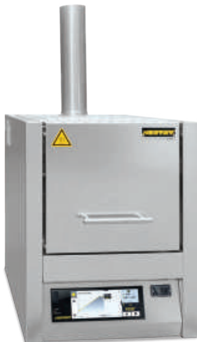
Ashing furnace LVT 9/11