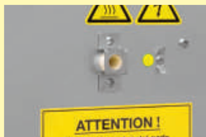
Ashing furnace LV 5/11 with port for thermocouple in the rear wall of furnace