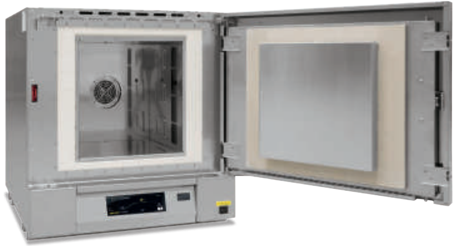
Forced convection chamber furnace NAT 50/85