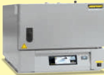
Forced convection chamber furnace NAT 15/85