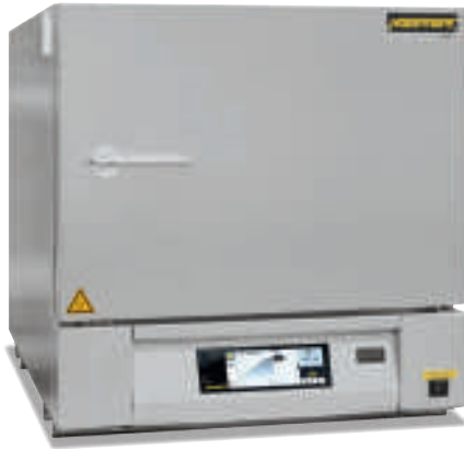
Forced convection chamber furnace NAT 30/85