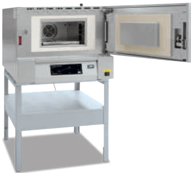
Forced convection chamber furnace NAT 15/85 with base frame as additional equipment

Applications include preheating of components for shrink-fit processes, heat treatment of metals in air such as aging, stress relieving, soft annealing or tempering, and heat treatment of glass.