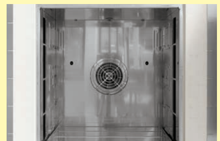
Interior made of stainless steel sheet 1.4828